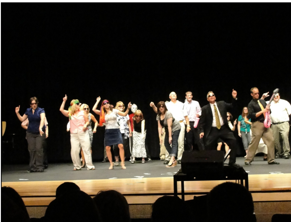
Teachers rock out to Aretha Franklin's "R-E-S-P-E-C-T."